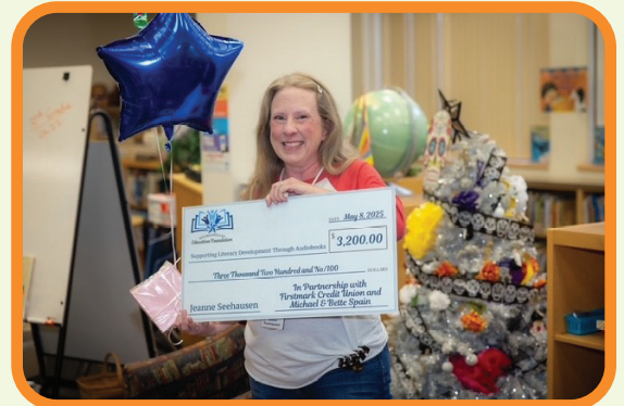
New Braunfels Education Foundation

We look forward to helping more foundations and schools throughout the remainder of the year!